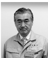
City Mayor Okubo Takashi

Thank you for your understand and cooperation.