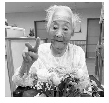
(Kitagawa-san: 114 yrs. old)

Those two persons in the pictures are the verified oldest woman and man living in Hikone.