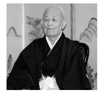
(Horii-san: 106 yrs. old)