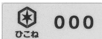
reflecting sticker for shoes (H1.5cm×W4cm)

Inquiries: Medical Welfare Promotion Division Tel 0749-24-0828 Fax 0749-24-5870