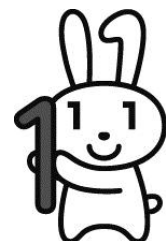
Application Form for Individual Number Card 個人番号カード交付申請書