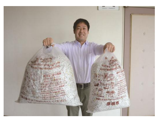
It is much bigger than the present extra large bags