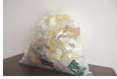
The new bags are transparent material (for Plastics)